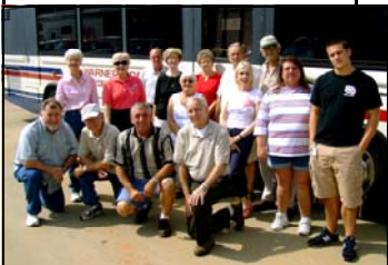
We welcomed a charter busload of Warner Robbins Club members to our show..

Atlanta Koi Chronicles is a monthly publication of the Atlanta Koi Club . Material is selected for its interest to Koi and Pond enthusiasts. AKC Koi Chronicles accepts no responsibility for the accuracy of the contents. Reproduction is permitted provided that this newsletter and/or the original source are credited. Articles may be submitted to the editor.